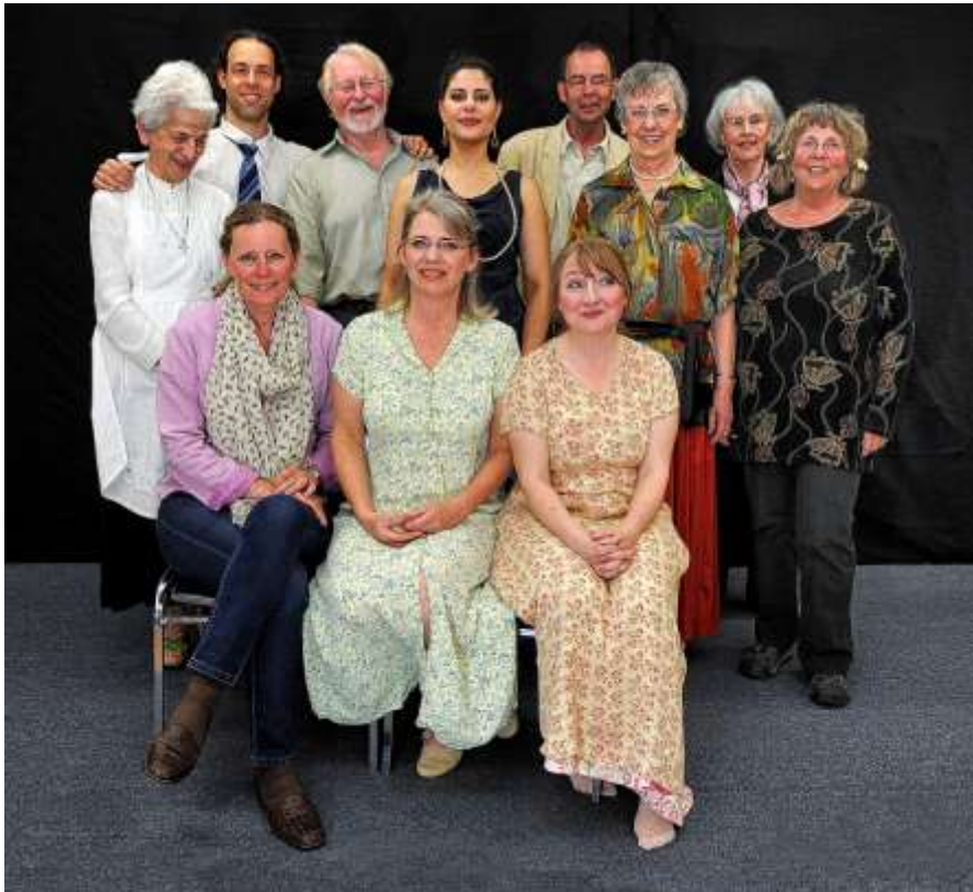
The cast and crew of “Enchanted April”