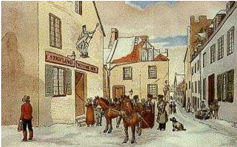
The Neptune Inn, Quebec City, in the 18th century; the kind of gathering place which served as this country's earliest theatrical venues

Theatre historian, David Gardner believes that European theatre came to Canada with Sir Humphrey Gilbert and "a little company of mummers" in 1583, predating Marc Lescarbot' production of Le Théâtre de Neptune en la Nouvelle-France on November 14, 1606. Samuel de Champlain, in Port Royal (in what is now Nova Scotia ) organized a social club called L'Ordre de Bon Temps and it was through the Ordre that Lescarbot mounted his entertainment, performed by members of the French colony disguised as natives and mythological beings. The purpose of the event was to celebrate the return of the colony's founders from a dangerous expedition. The site of the colony and the production was abandoned in 1607 and there is no other mention of theatrical activity until 1640, though it is more than likely that light-hearted entertainments were presented as a part of colonial life.