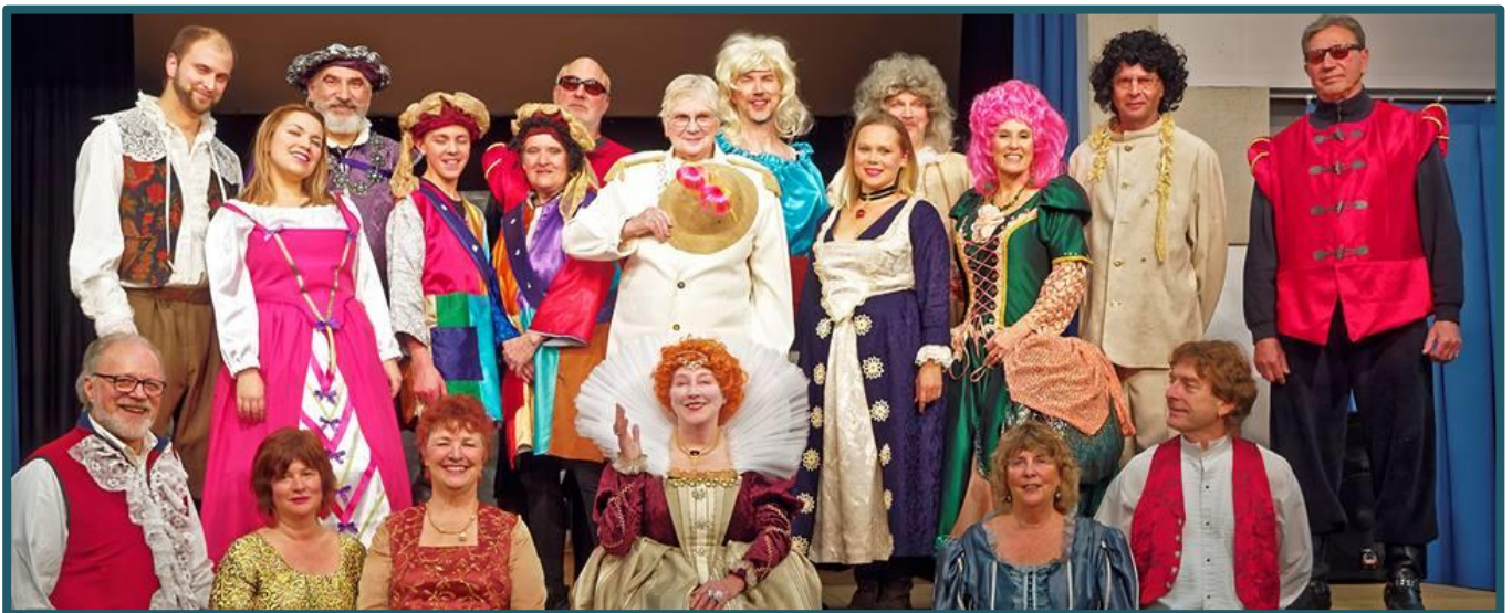
The wonderful cast of Will Shakespeare The Panto .