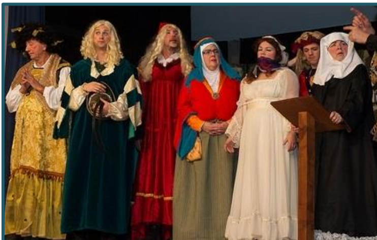
Girls just wanna have fun.