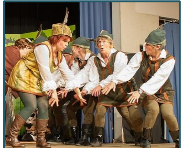
Men in Tights – They're butch!