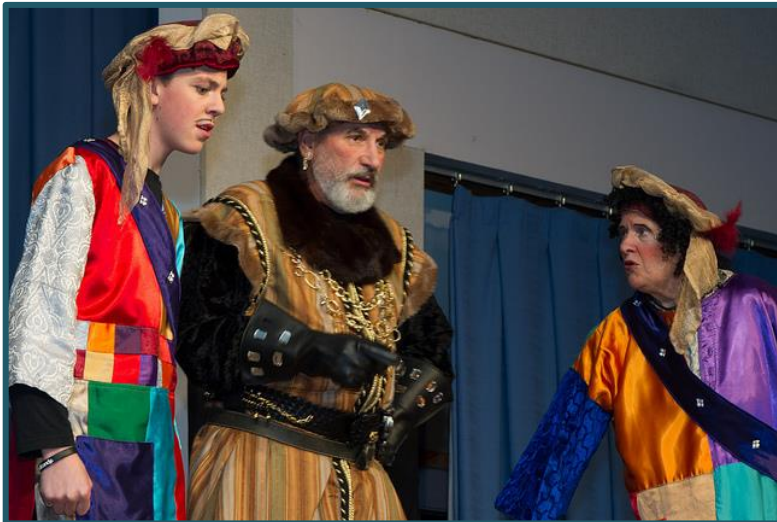
"Are you sure you're in the right panto?"