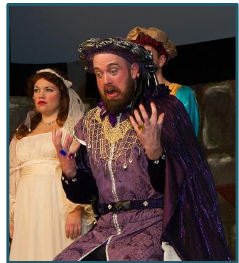
"King Richard's back?!?"