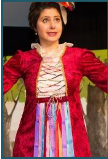
"I have a cunning plan."