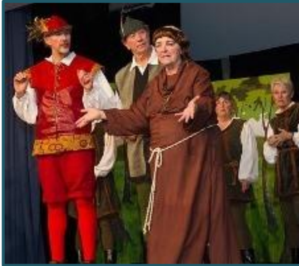
The moderately merry men.