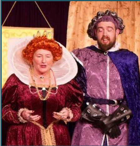
Not one, but two villains to boo.

It was double the fun in November with The Return of Robin Hood , our tenth panto at the Community Hall.