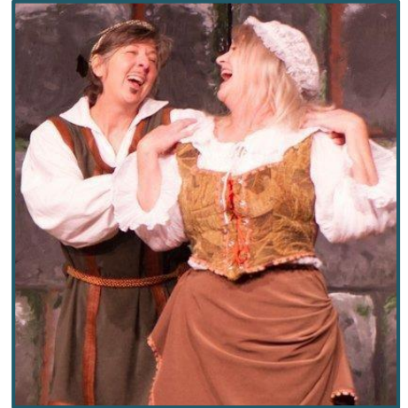
but two pairs of lovers to cheer.