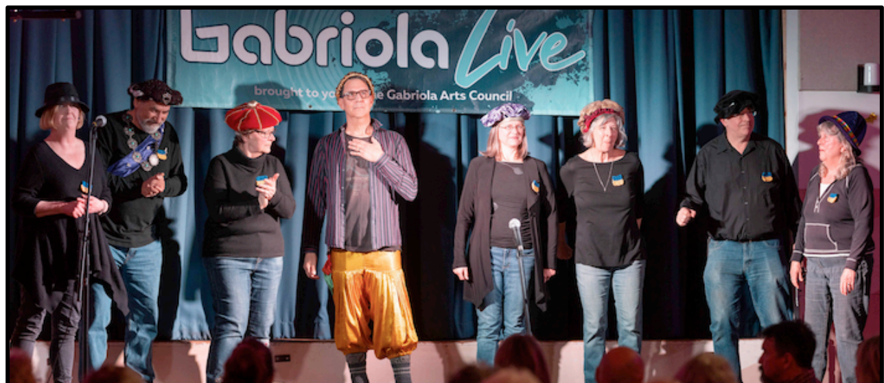
Members of Gabriola Players performing at the Gabriola Arts Council Carry On fundraiser in March.

Looking forward to seeing you at the Rollo next month!