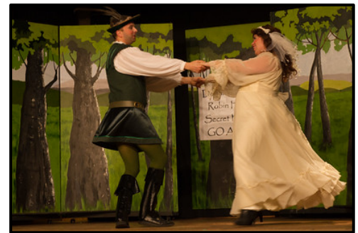
And set painters transport us to Sherwood Forest and beyond.

Good project management skills? You're a natural producer. Dab hand with a needle, a paint brush or make-up? We'd like to hear from you. We're always on the lookout for people willing to do set changes, prompt, find props or work front of house on tickets or concessions.