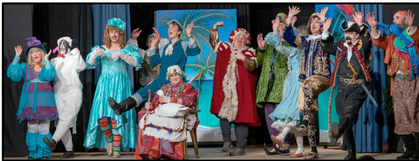
That's when wardrobe wizards help make magic like this.

If you think it might be fun to get involved in a Gabriola Players production, you'd be right. Stage fright? No worries, there are many backstage roles to fill – particularly with the panto when offstage volunteers usually outnumber the large cast by at least three to one.